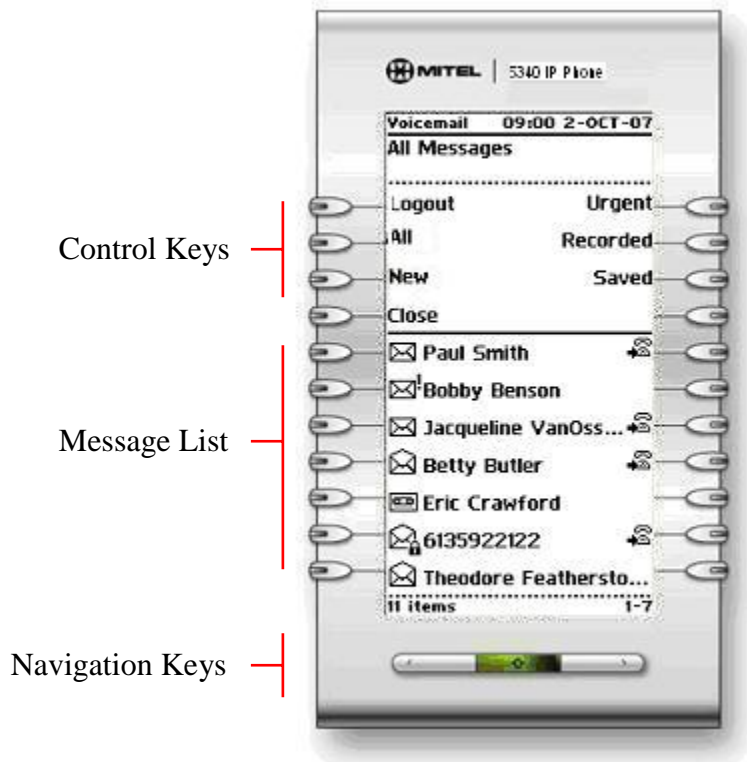
The Voice Mail Application Main Window

The Voice Mail application main window contains a chronological list of the voice messages in your mailbox, with the oldest message listed first. Use the Navigation keys to scroll through the messages. By default, only new messages are listed when the main screen opens. You sort the list by message type using the sorting keys (All, New, Urgent, Recorded, Saved) in Control keys area. Messages are marked in the following ways: