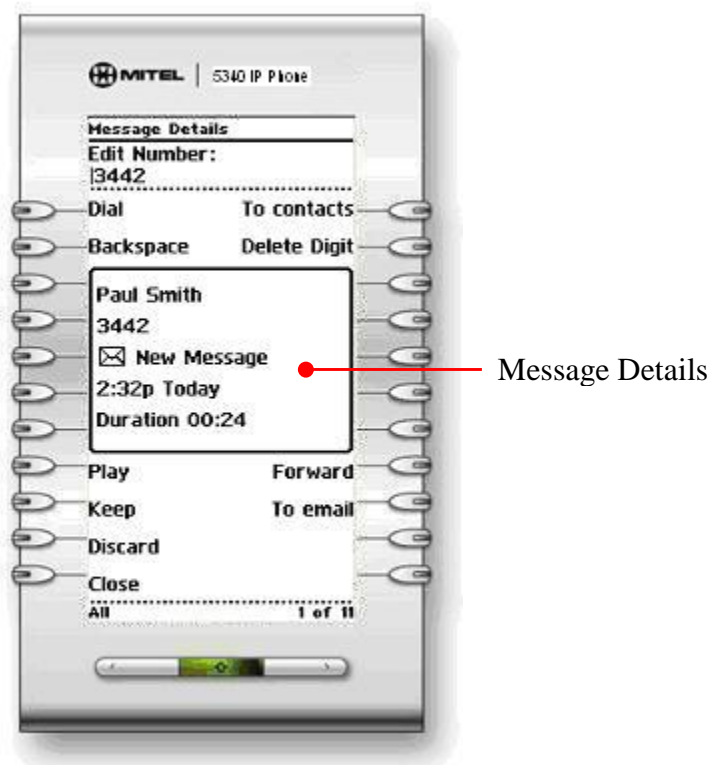
The Message Details Window

In this window, you can save (Keep), play, or delete (Discard) the message. You can send the voicemail to your email if the Forward to Email feature is enabled or forward it to another user. You can dial the message sender or add the message sender to your contact list in the People application.